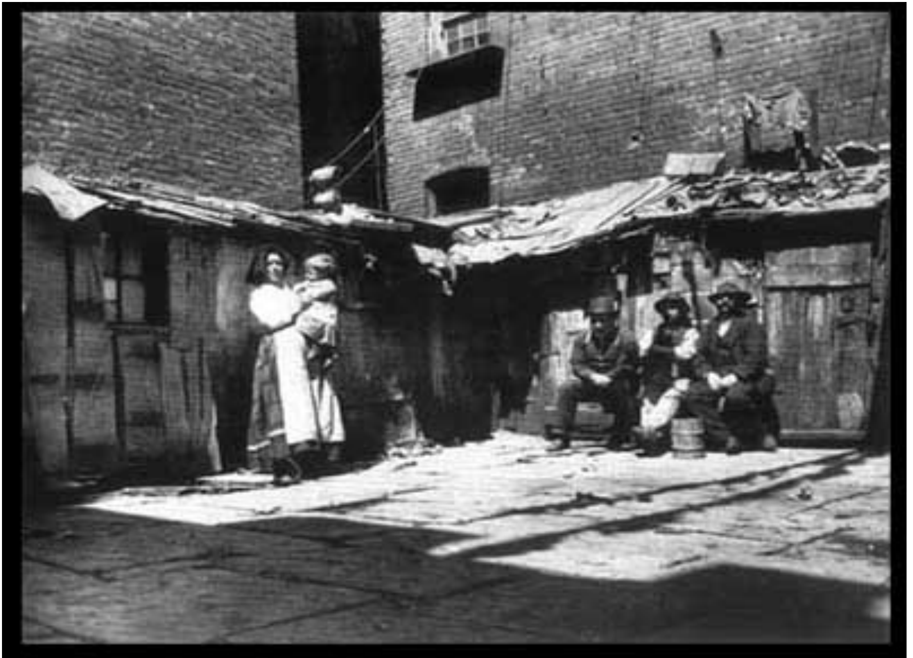
Riis, "It Costs a Dollar a Month to Sleep in These Sheds"