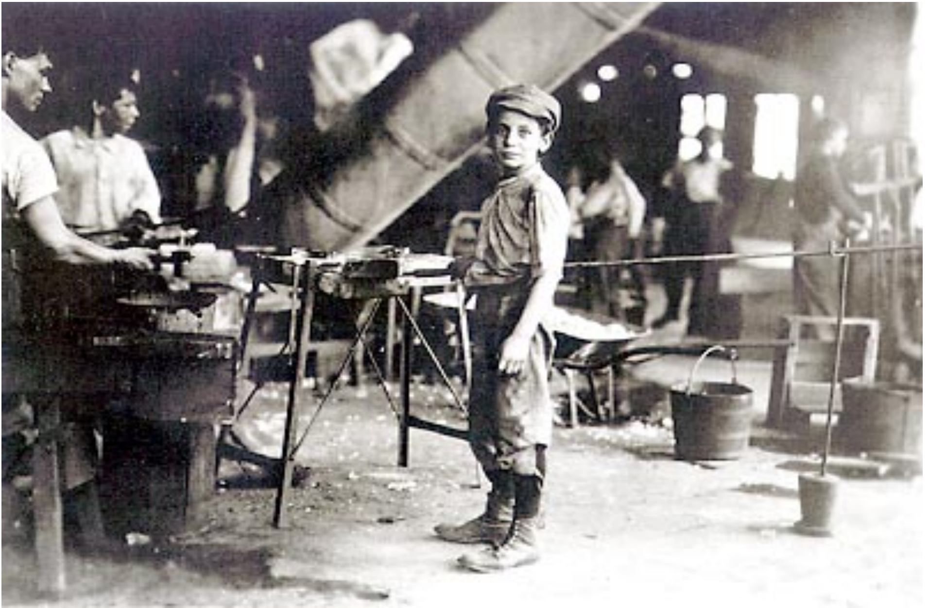
Hine, "A Young Glassworker"