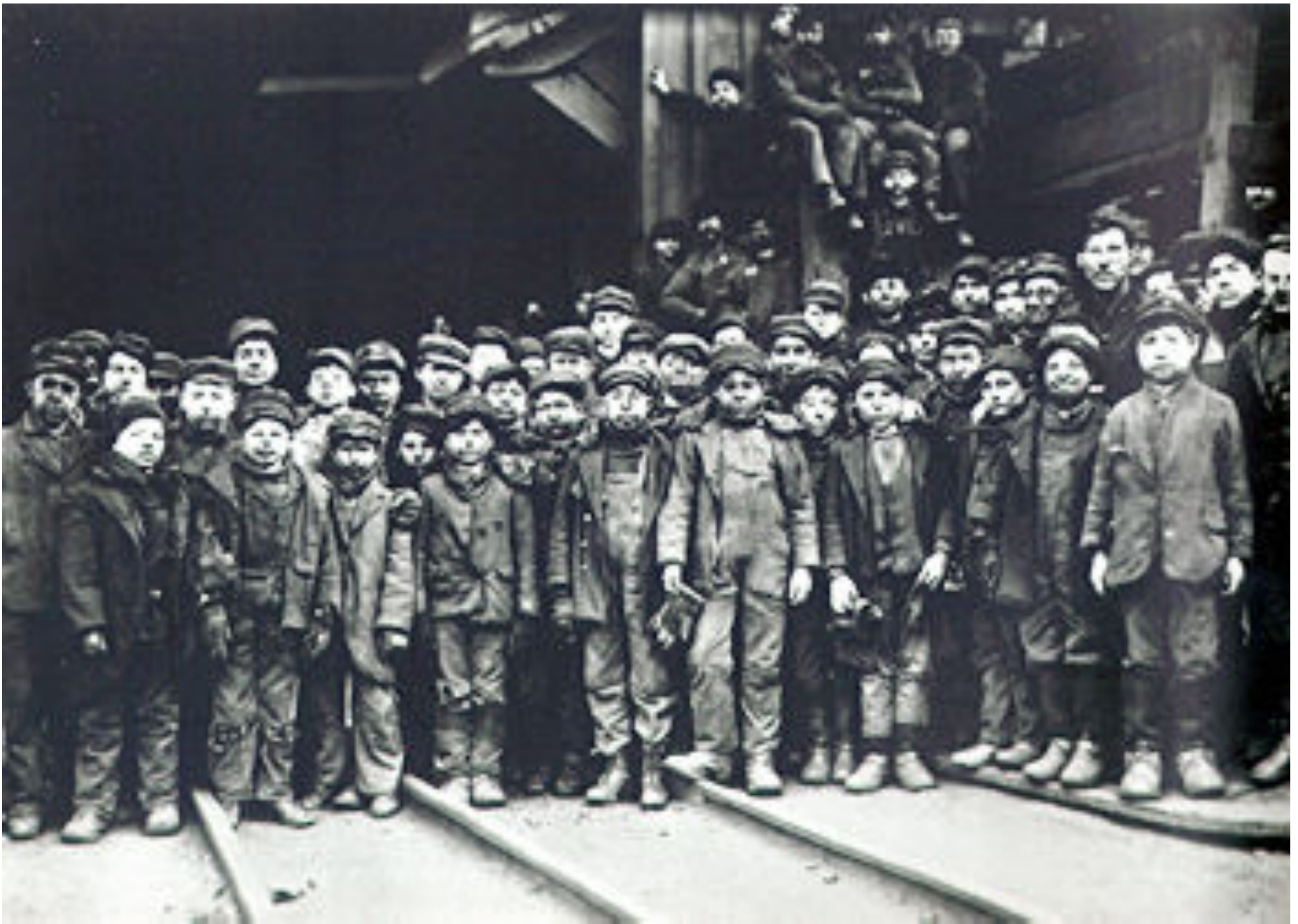
Lewis Hine, "Breaker Boys"