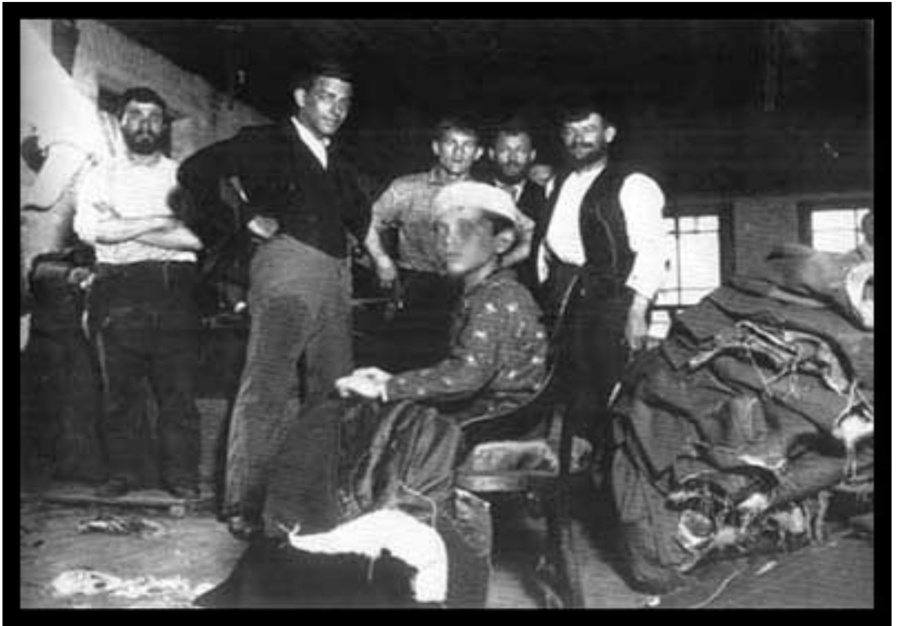
Riis, "In a Sweatshop"