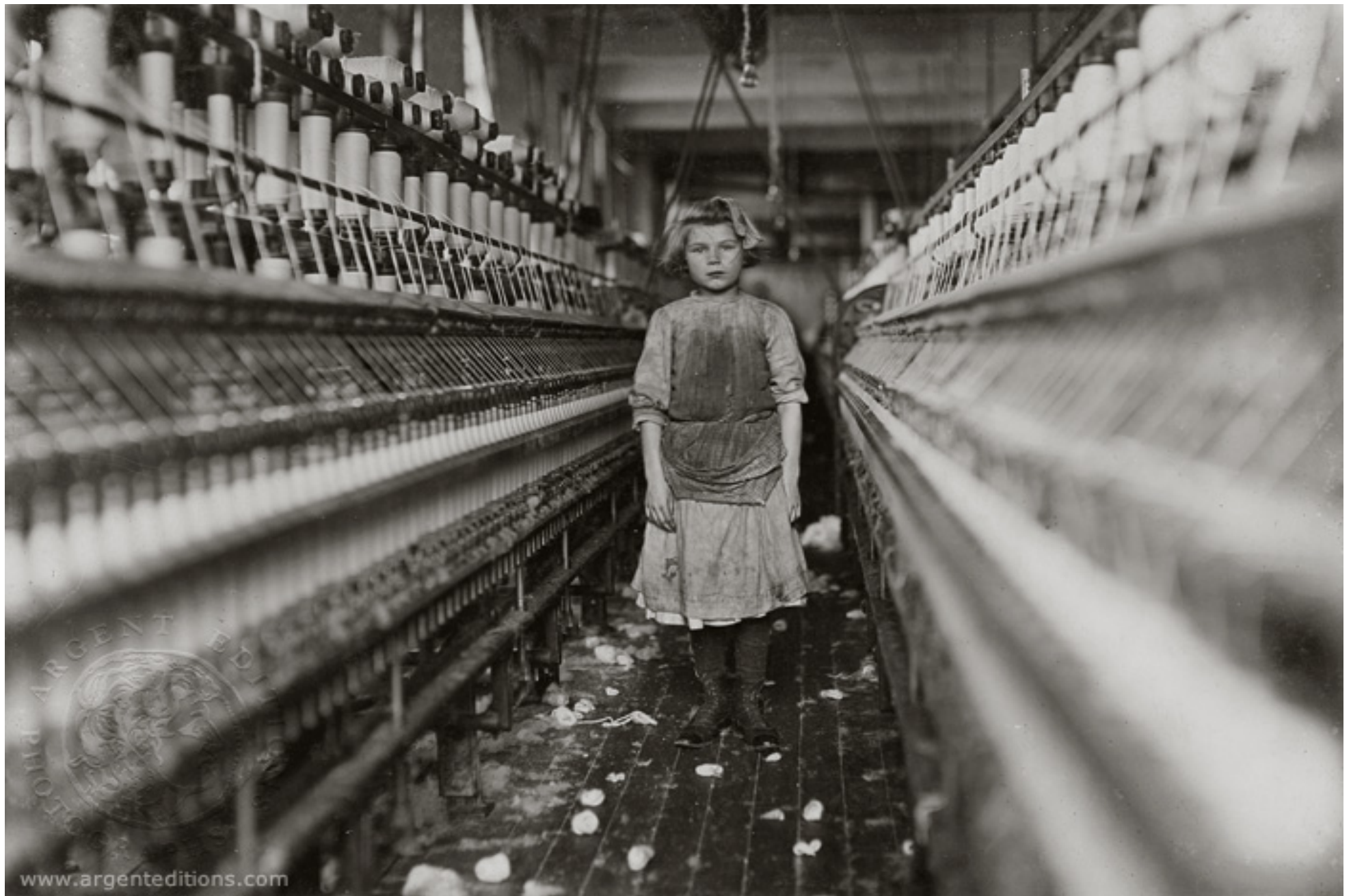
Hine, "Little Spinner Girl," Augusta, GA (1909)