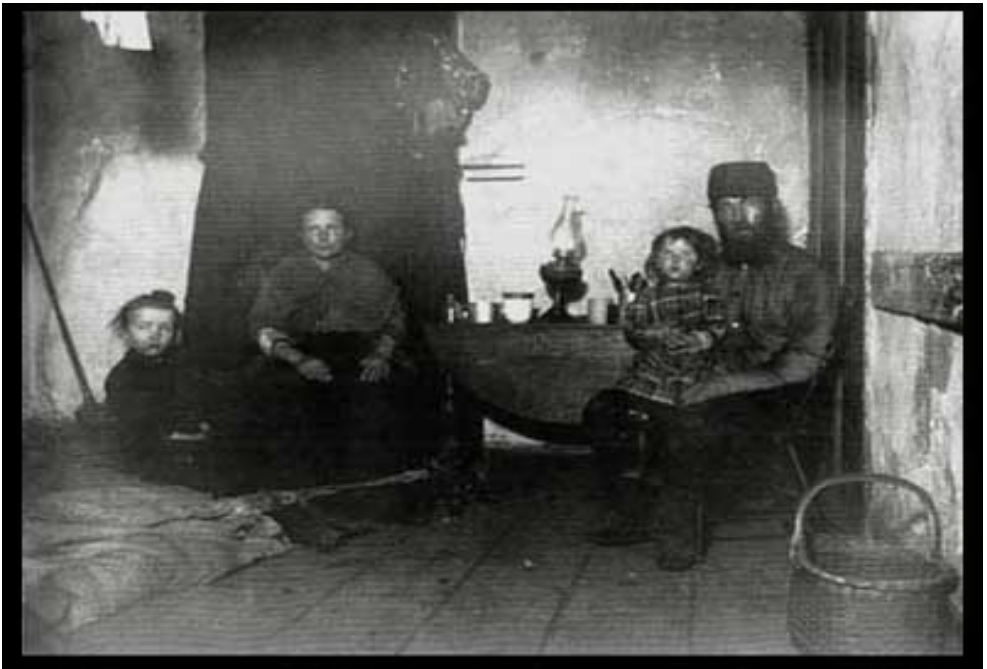
Riis, "In Poverty Gap, an English Coal-Heaver's Home"