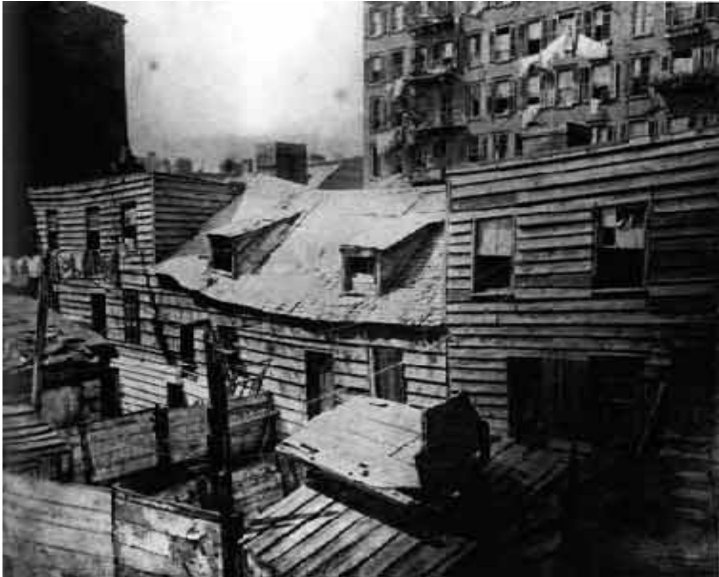
Jacob Riis, “Dens of Death”