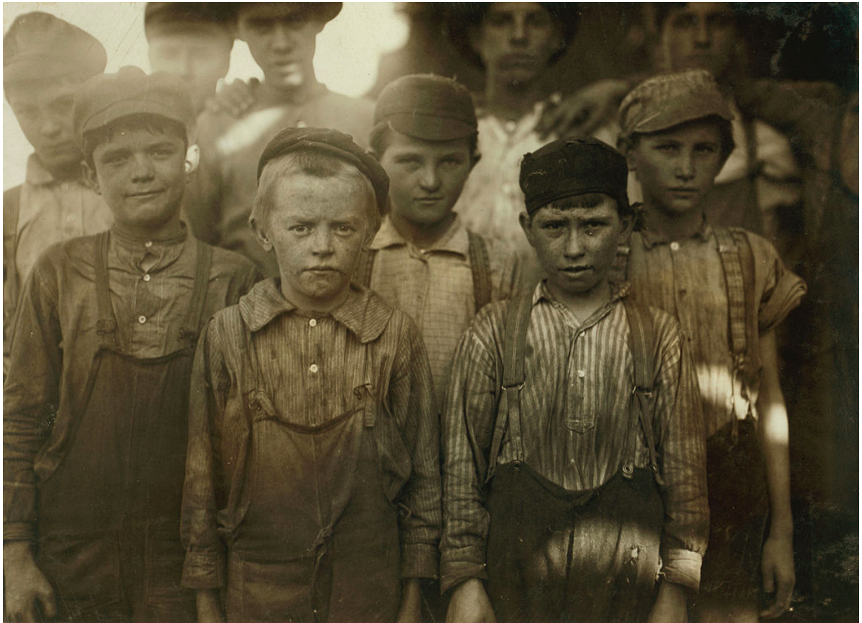
Hine: Avondale Mills in Birmingham, AL (1910)