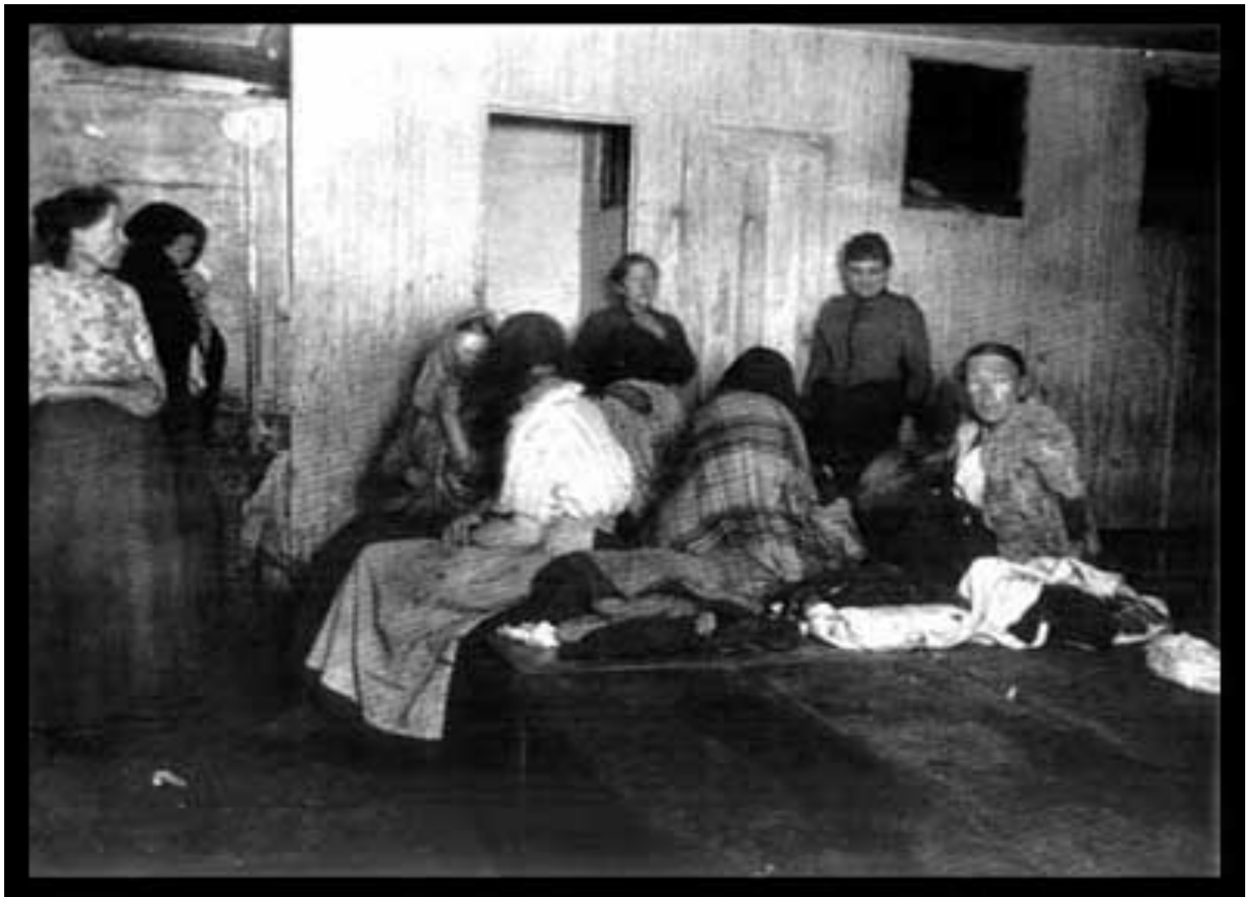
Riis, "Eldridge Street Police Station Lodgers"