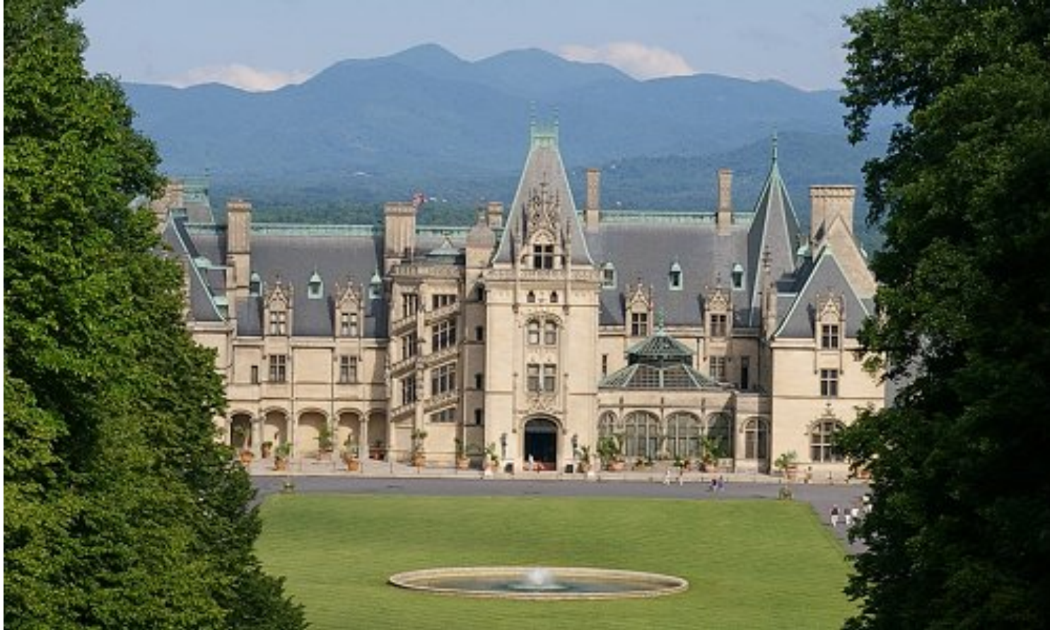
Biltmore Estate: Asheville, North Carolina Also built for the Vanderbilt family, it has 250 rooms!