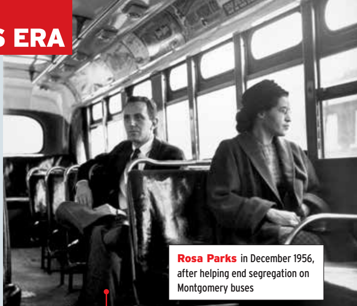
Rosa Parks in December 1956, after helping end segregation on Montgomery buses