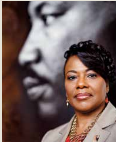
Bernice King was 5 years old when the civil rights icon was assassinated.

They're very faint. I had just turned 5 prior to his assassination. He was traveling a whole lot. [But] he loved playing with us. We were like his refuge from all the seriousness of the work he was doing to bring about change in the world.