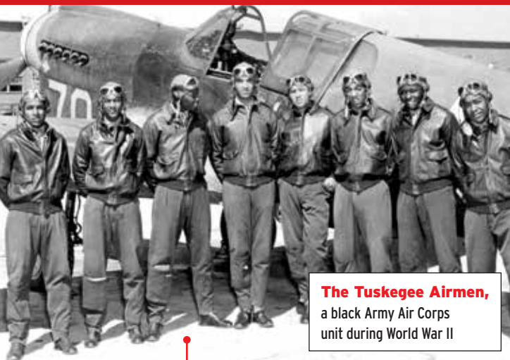
The Tuskegee Airmen , a black Army Air Corps unit during World War II