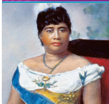
Queen Liliuokalani 1838–1917

Liliuokalani was Hawaii's only queen and the last monarch of Hawaii. She bitterly regretted her brother's loss of power to American planters and worked to regain power for the Hawaiian monarchy. As queen, she refused to renew a treaty signed by her brother that would have given commercial privileges to foreign businessmen. It was a decision that would cost her the crown.