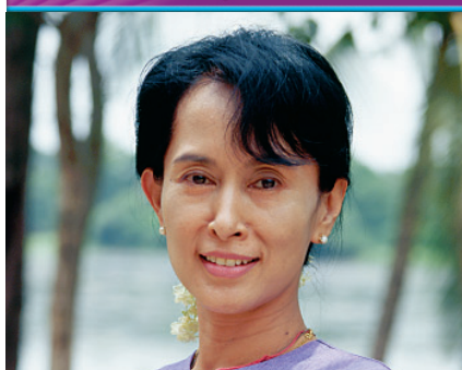
Aung San Suu Kyi 1945–

Aung San Suu Kyi won the Nobel Peace Prize in 1991 for her efforts to establish democracy in Myanmar. She could not accept the award in person, however, because she was still under house arrest.