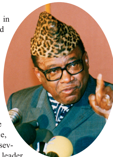
▲ Mobutu Sese Seko

On becoming president, Kabila promised a transition to democracy and free elections by April 1999. Such elections never came. By 2000 the nation endured another round of civil war, as three separate rebel groups sought to overthrow Kabila's autocratic rule. In January 2001, a bodyguard assassinated Kabila.